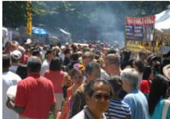
5 th Asian Festival 2008