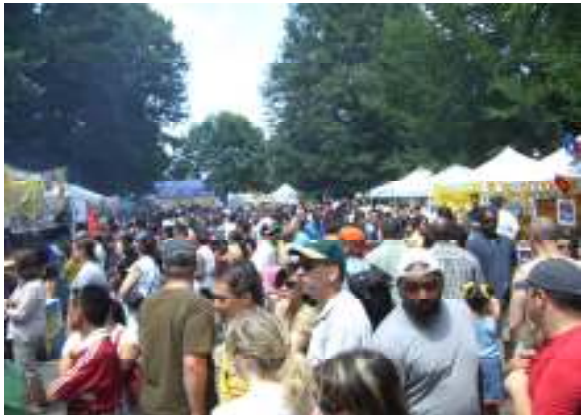
4 th Asian Festival 2007

Large Crowds – more than 65,000 attendees expected over 2 days. Attracted over 50,000 attendee in 2008